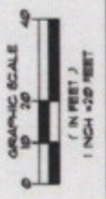
PROPOSED GRADING PLAN SCALE: 1"=20'