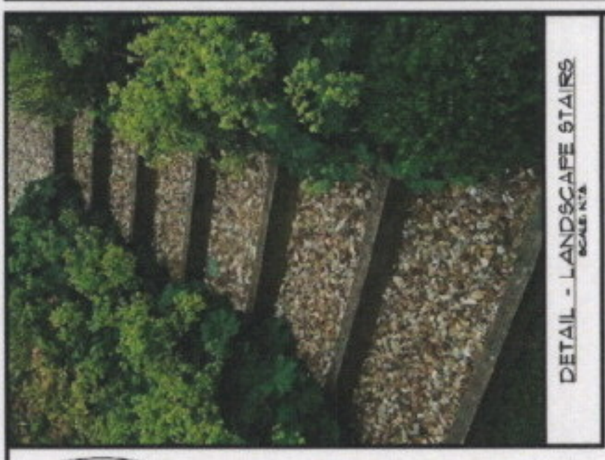
DETAIL - LANDSCAPE STAIRS SCALE: N/A

PROPOSED EROSION CONTROL: PROPOSED 41" WIDE TIMBER LANDSCAPE STEPS WITH PEA STONE PROPOSED 41" WIDE WOODEN STAIRWAY ON NO TREE REMOVAL OR EXCAVATION REQUIRED